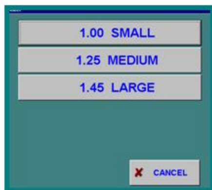
SIZE OPTION SCREEN