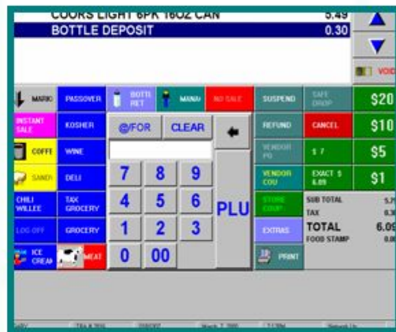
POS MAIN SCREEN